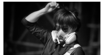
'WE LIVE IN TRAGIC TIMES' - MERCY AND SORROW