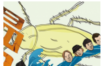
SHANGHAI 247 PODCASTS - WHAT'S GOING ON - 05/12/2012