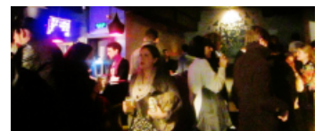
FEELING THRIFTY? THE NIGHT MARKET AT DADA MIGHT JUST HAVE WHAT YOU'RE LOOKING FOR