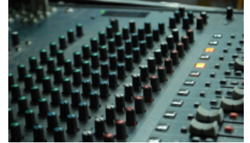
CITY SOUND TRAVEL: SOUND ARTIST YIN YI